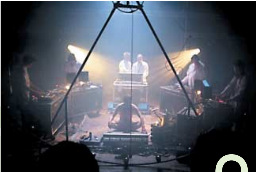
Theatre Orchestra of Finland , created by the lighting and sound students at the Theatre Academy of Finland, featured a microphone on a swinging pendulum and six musicians playing a variety of electronic instruments.