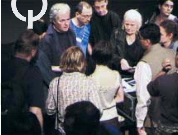
Composer and director, Heiner Goebbels (second from left) talks with Scenofest participants.