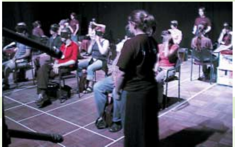
Blindfolded, the audience experiences Theatre in the Dark , created by students at Central School of London.

There were many Scenofest programs in which the timely art of sound took centerstage. For instance, internationally acclaimed composer and director Heiner Goebbels spoke about, and shared examples of, some of his critically acclaimed works for theatre, including Max Black and Hasbirigaki .