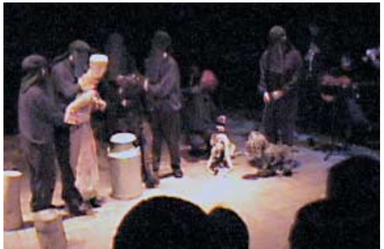
Music students play their stunning music score in the background as the Royal Welsh College of Music and Drama Puppet Theatre performs Wide Awake and Dreaming .

Goebbels often works with contrasting styles, as exemplified in the juxtaposition of African (Senegalese) and Western music and instruments in his music theatre piece, Or the Hapless Landing .