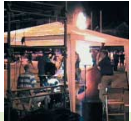
A hot jazz band played as the demon head burned.