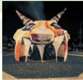
For the day-long workshop, Fiesta of Fire, a demon head was built, filled with personal objects and then burned.