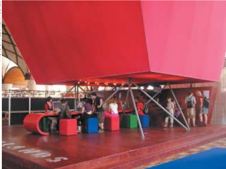
The exhibit from the Netherlands had comfortable seating that facilitated watching, and listening to, video presentations.

The Heart of the PQ presented a never ending array of performance art and other presentations, often having several performances occurring at the same time in the same space. Here, the theatre was predominantly being created in real time, rather than being a recreation of a theatre production from another place and time. The cutting edge nature of the Heart of PQ provided a constant challenge to its visitors to question their own assumptions about the nature of theatrical performance.